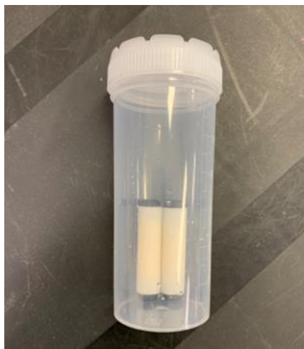
Figure 3: MPT passive samplers removed and placed in container for return.