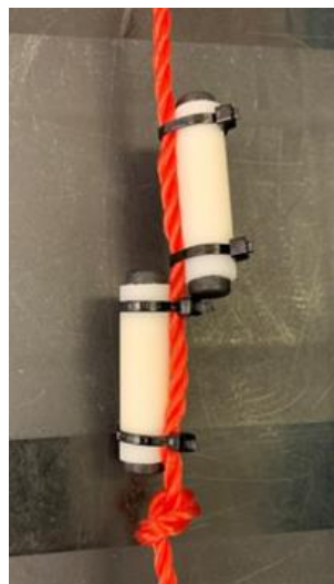
Figure 2: Photo of replicate MPT passive samplers secured to deployment rope.